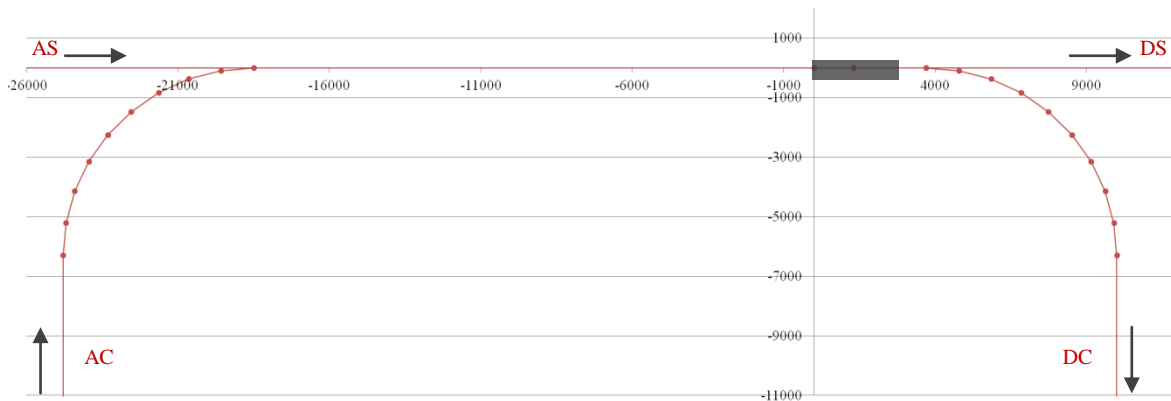
Figure 3-1: Reference case routes

The routes and coordinates are presented in Appendix A, Table A-11 and illustrated in Figure 3-1 below.